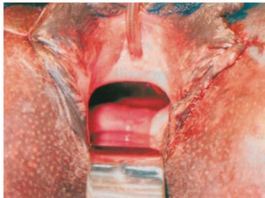
Figure 3. A giant vesicovaginal fistula