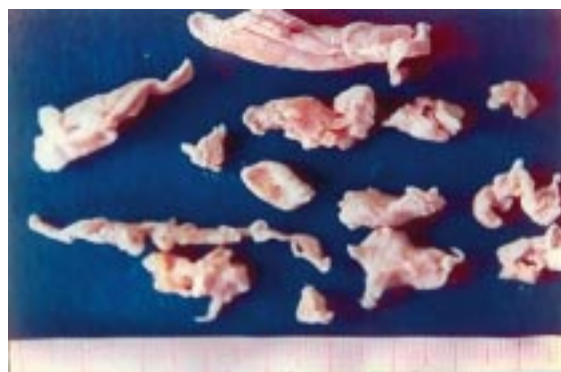
Fig. 3 – Fragments expelled by the patient with the radiolucent staghorn calculi.

In the past, almost all matrix stones were treated by open surgery. 2,3 With the development of endourology, percutaneous nephrolithotomy and ureteroscopy became the leading treatment options. 4, 5, 6, 7 However, the scant literature on matrix stones does not allow to consider any treatment as Standard therapy. To the best of our knowledge, there is only one paper in the literature where ESWL was used in the treatment of matrix stones. 8 The main reason may reside in the theoretical incapacity of ESWL to destroy mucoprotein, given its acoustic impedance close to that of the water. Nevertheless, in all our four cases, fragments of matrix stones were expelled after every ESWL session. We believe that ESWL promotes the disruption of the mucoprotein fibrillar and laminar structure links by the explosive effect of cavitation. 9,10 This promotes the detachment of the stones from the renal calices and pelvis, allowing the elimination of