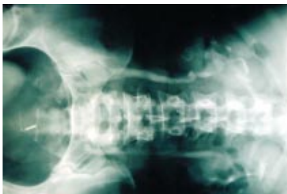
Fig. 1 – Staghorn radiolucent matrix calculi (easily detected by ultrasonography due to their fine struvite incrustations).